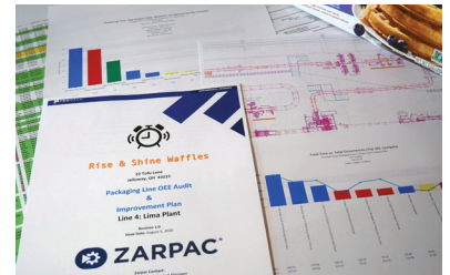
Deliverables Include a Detailed Report Identifying the Root Causes of Downtime and a Plan for How to Eliminate Them

For more information about Monitor & Report, visit www.zpisoftware.com .